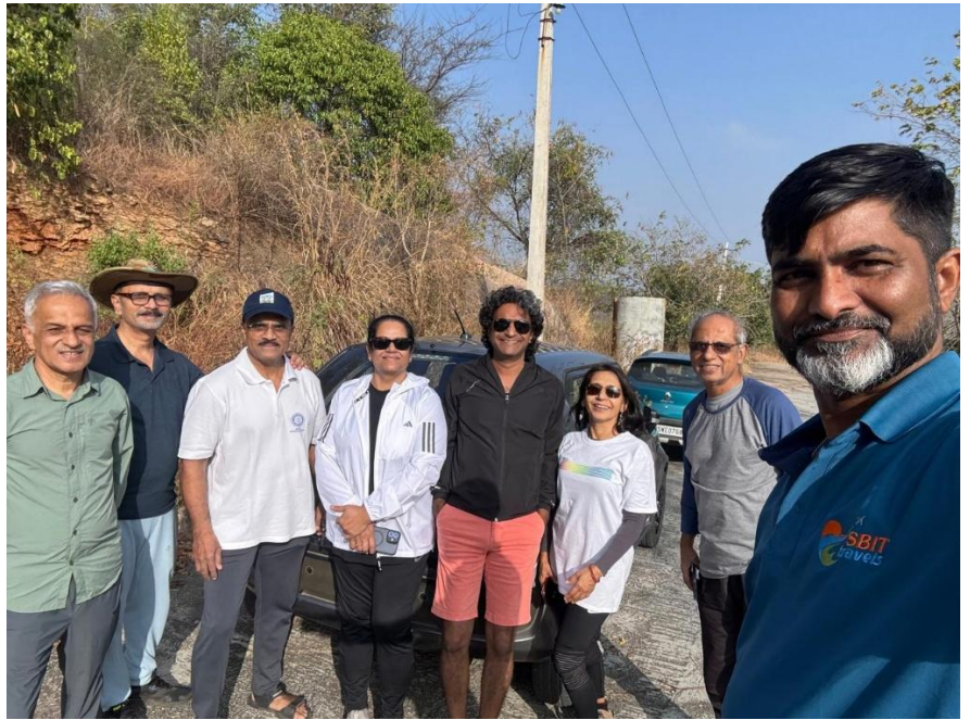
Trekkers of RoBaNo and their Friends, trekked to Narasimhaswamy Betta near Kanakapura, on 1-02-2026. Seen here, after successfully reaching the summit and returning to Base.