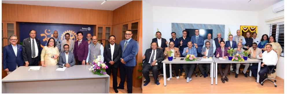
Inauguration of DGE's Office near South End Circle, on 23-01-2026