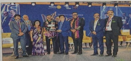
Dignitaries at 'Vismaya,' the annual conference of Rotary International District 3192. The two-day event concluded on Sunday.